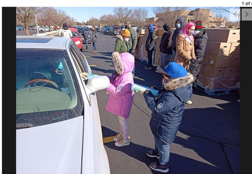
Volunteers of all ages helped out Tuesday at Purdue University Northwest when the United Way of La Porte County, Northern Indiana Food Bank and Citizens Concerned for the Homeless conducted the county's largest mobile food distribution since the start of the pandemic.